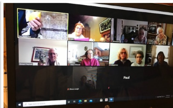
Sukkot via Zoom