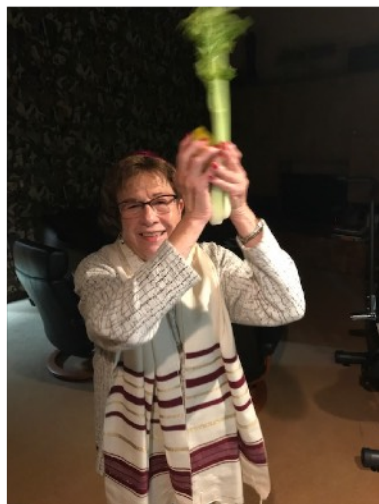
Sukkot: No lulav & etrog? Use celery & lemon!