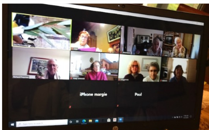
Sukkot via Zoom