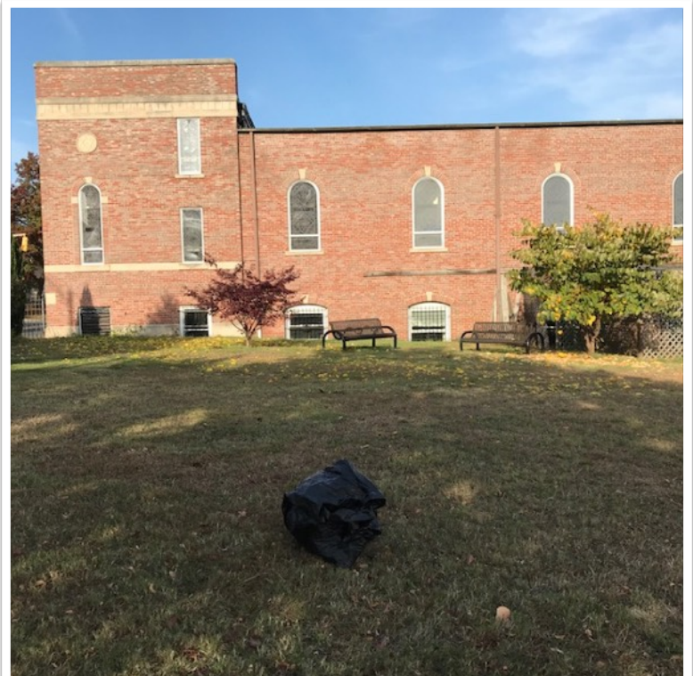
Trees pruned/lawn clean