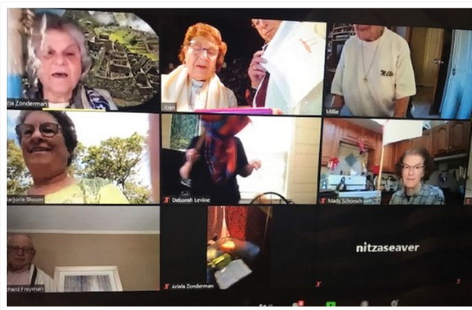
Simchat Torah via Zoom