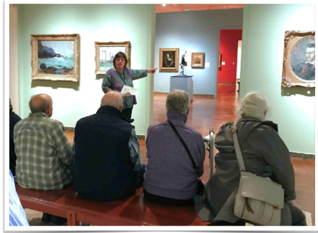
Stories about Pissarro