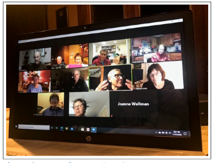
Study Group on Prayer - 1st Meeting