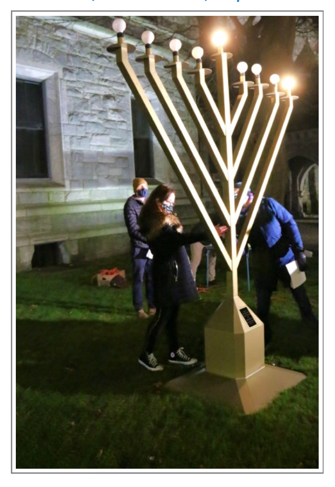
Brielle lighting the candles