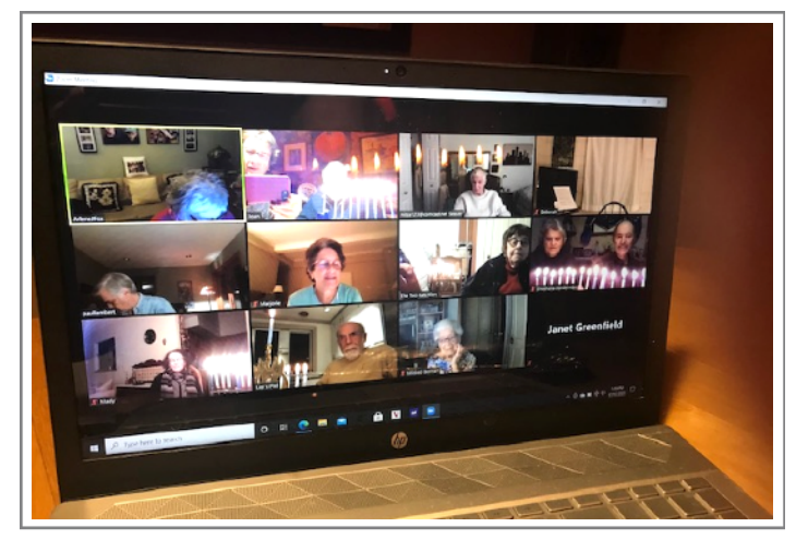
8th Night of Hanukkah via Zoom