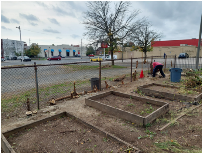
Yoni: Getting more roots pulled