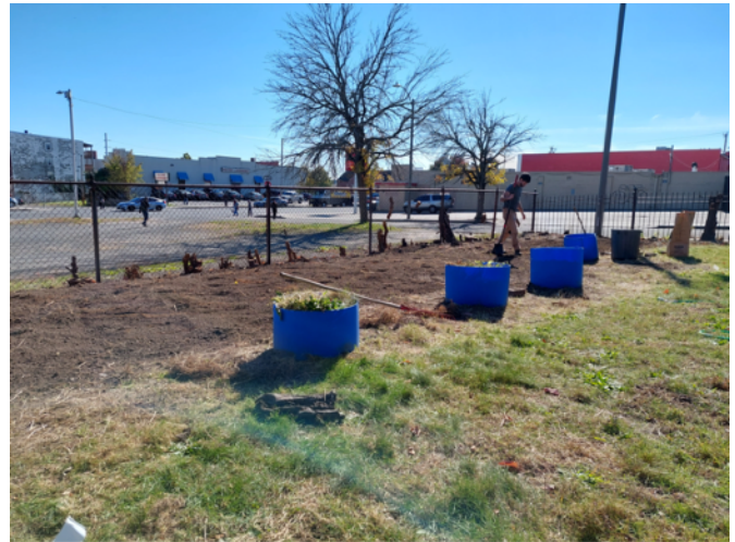
Yoni: Almost ready to sow grass seed

A tremendous TODAH RABAH goes out to all the garden workday volunteers who came together on several occasions to weed, dig, and prepare the SOZ yard for planting. Also a huge shout out of appreciation to Phil and Bill Os, the landscapers who cleared the trees, vines and general tangles that were too much for the volunteer crew to manage.