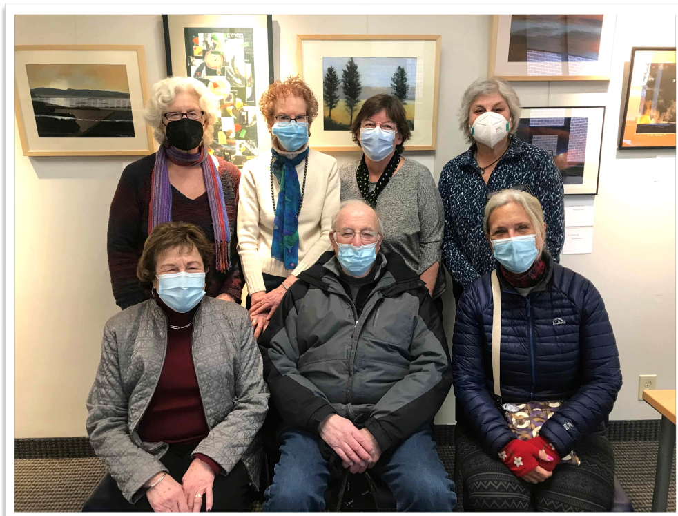
Group shot by the exhibit