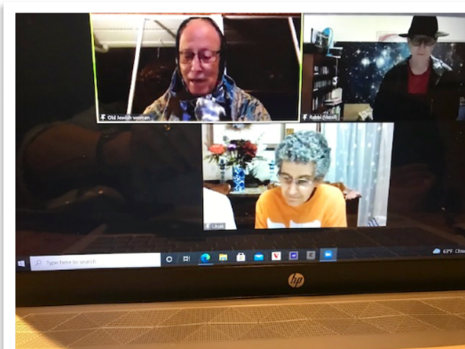
Characters in the S'lichot Play