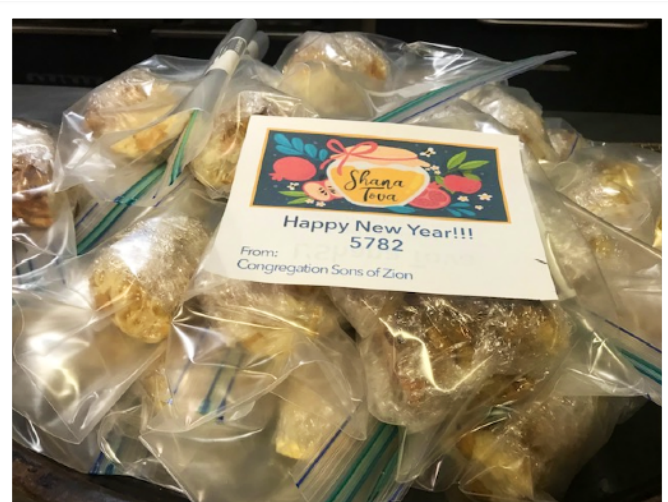
Kugel Ready for Pick-Up!