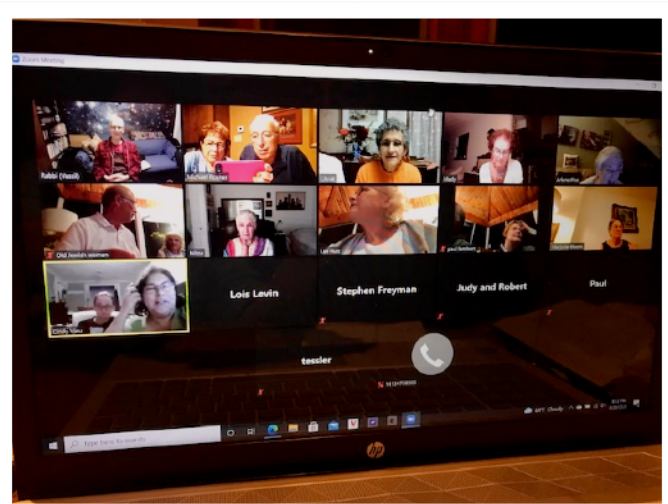
Enjoying the S'lichot Play